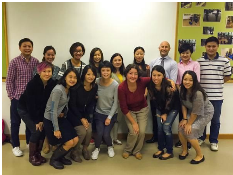
Some of the members of our newly appointed PSA Executive Committee